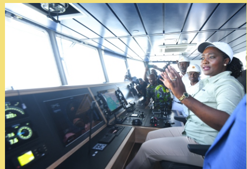
CS Tuya inspects the ship deck