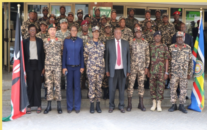
Namibia Defense Forces Students group photo