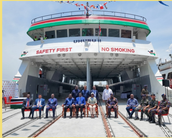
Defense CS Hon. Soipan Tuya, Transport CS Hon. Davis Chirchir, PS Industry Dr. Juma Mukhwana Siaya Governor James Orengo and other leaders group photo